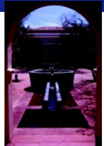
A water fountain is a central feature of the Heard's newly bricked Central Courtyard.

The internationally acclaimed Heard Museum is one of the best places to experience and to learn about the fascinating cultures and art of Native Americans of the Southwest. The museum is known for its extensive collection of artifacts and fine art from the Southwest.