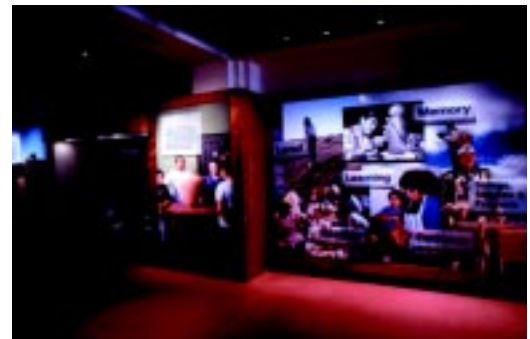
The exhibit More Than Art is an introduction to the art and cultures of the Southwest.